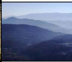
- Around campus and the Blacksburg area