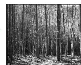
Your management plan may vary depending on the species composition of your forest. Shown here is a yellow poplar plantation in SW Virginia.

By: Bill Worrell, Forestry & Natural Resources Extension Agent