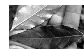
Silvery backside (top) and gray-green surface (bottom) of autumn-olive leaves.

Leaves: simple, alternately arranged, upper surface green to grayish-green and scaly; undersides covered with silvery-white scales