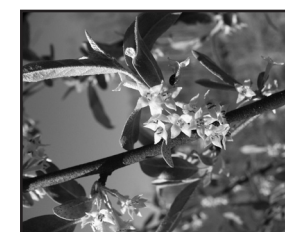
Small yellow flowers along branch.

Flower: yellow, bell-shaped, borne along current year's twigs, appear in late April through May, after first leaves appear