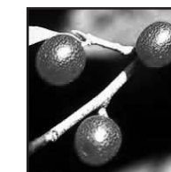
Close up of ripe berries on an autumn-olive branch.

Fruit: borne along current year's twigs, 0.25 to 0.33 inches, pink to red and covered with silvery scales; sweet & juicy; mature in late summer